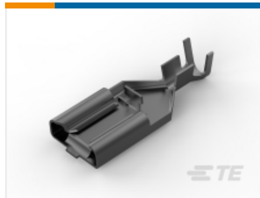
TE Part # 170381-1 PL .312 REC AV 0.5-2 MM2 PRE-TPBR