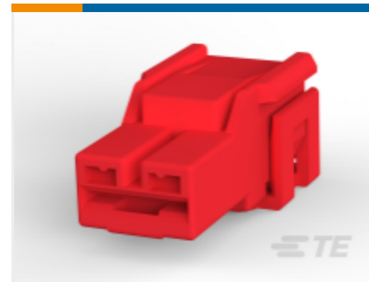
TE Part # 172863-8 250 P.LOCK MK-II 1P HSG RED