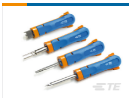
TE Part # 724719-1 EXT.TOOL FOR SHIELD BEAM